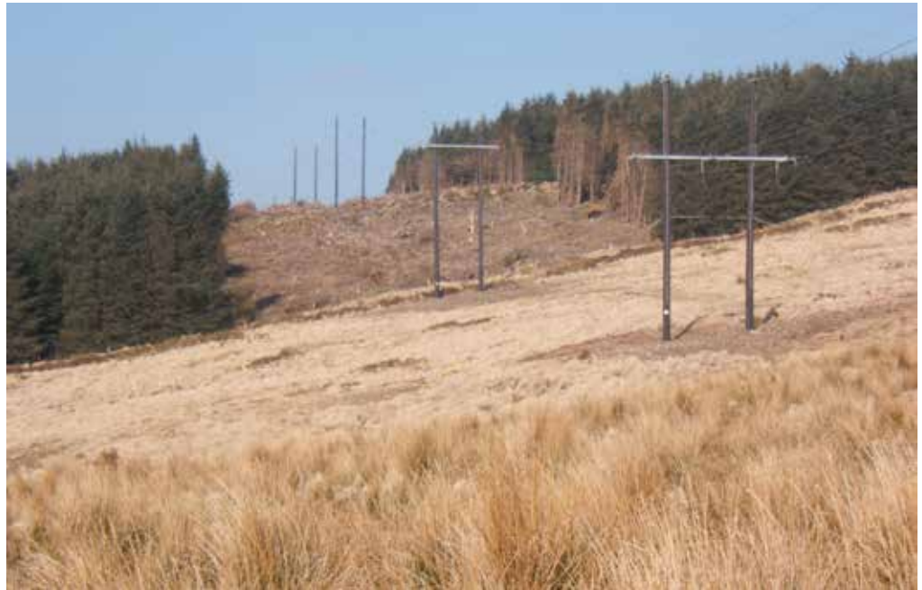
Photo 9 A newly-erected power line through felled forest. Various legislation may exempt such felling from the requirement for a Felling Licence.