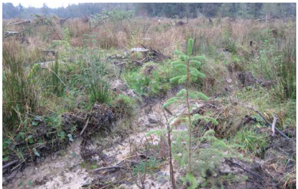
Photo 4 Reforestation with Sitka spruce for wood production (Objective CF). Slieve Blooms, Co. Offaly.