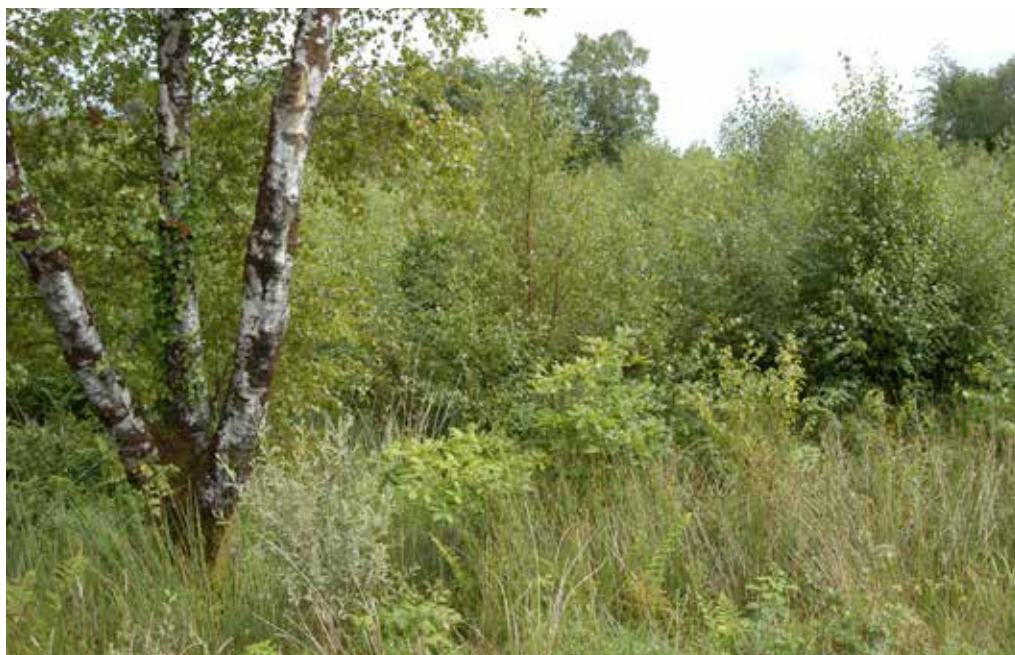
Photo 6 Where viable, natural regeneration can form part of Objective BIO.