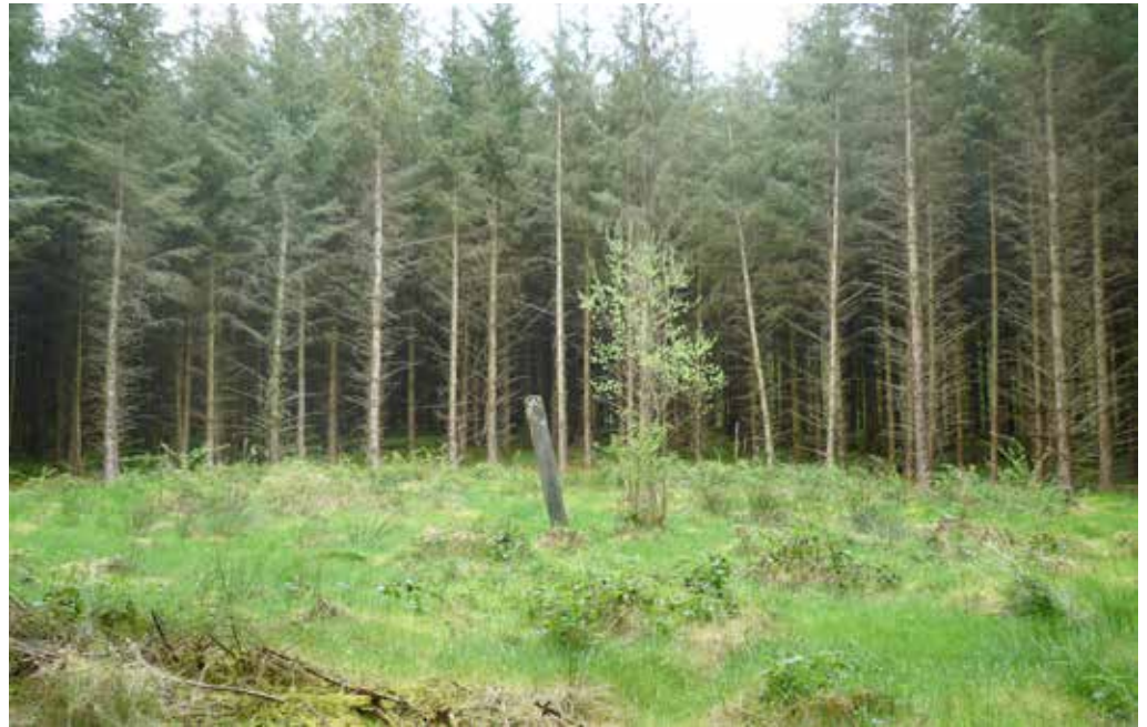
Photo 3 A standing stone within a setback created during thinning, in order to afford the Recorded Monument greater protection during future forest operations, to improve accessibility and to enhance visitor experience. Coillte's Kilpatrick Wood, Co. Westmeath.

and to associated features and artefacts. The early identification of the location, nature and extent of such archaeological sites and monuments or other important built heritage structures or features, the incorporation of these considerations into a site-specific felling plan, and subsequent due care during the execution of the planned operations, will all help to avoid or minimise the risk of any damage.