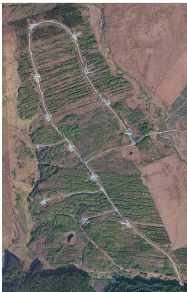
Photo 8 A wind farm within a forest plantation. Forest Service policy is to facilitate wind energy within the context of SFM and the expansion of the national forest estate.

In line with general Forest Service policy, where grant-aided forestry is to be used for wind farm development, any grants and premiums already paid out by the Forest Service in relation to the areas felled for the turbine bases, roads and infrastructure must be repaid where the forest is still in receipt of afforestation premiums and / or still in contract under the Afforestation Scheme.