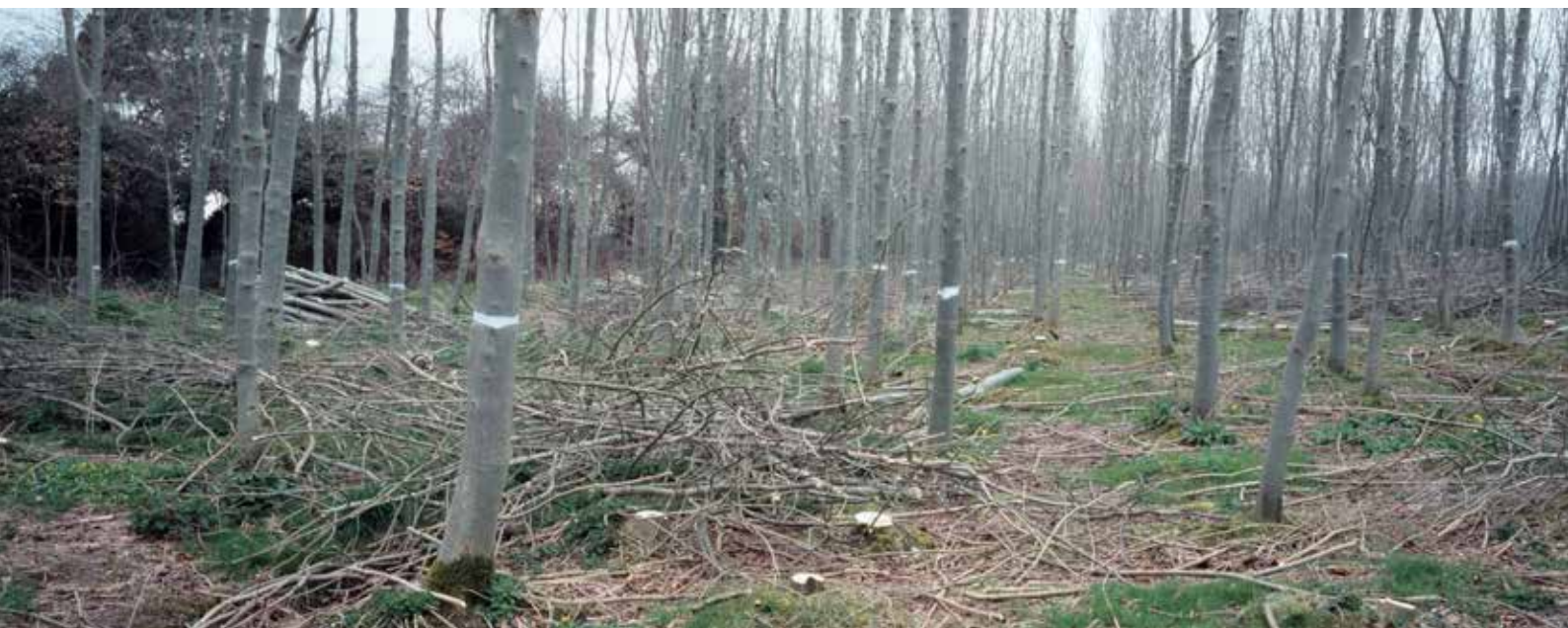
Photo 2 A well-thinned stand of ash, with future growth targeted on identified potential final crop trees.

Please note that if a licence has been granted subject to conditions, and the applicant has appealed against one or more of the conditions, no trees shall be felled or otherwise removed and, for the purposes of subsection 17.6 of the Forestry Act 2014, the licence shall be deemed not to have been granted, pending the final determination of all proceedings in respect of the conditions concerned.