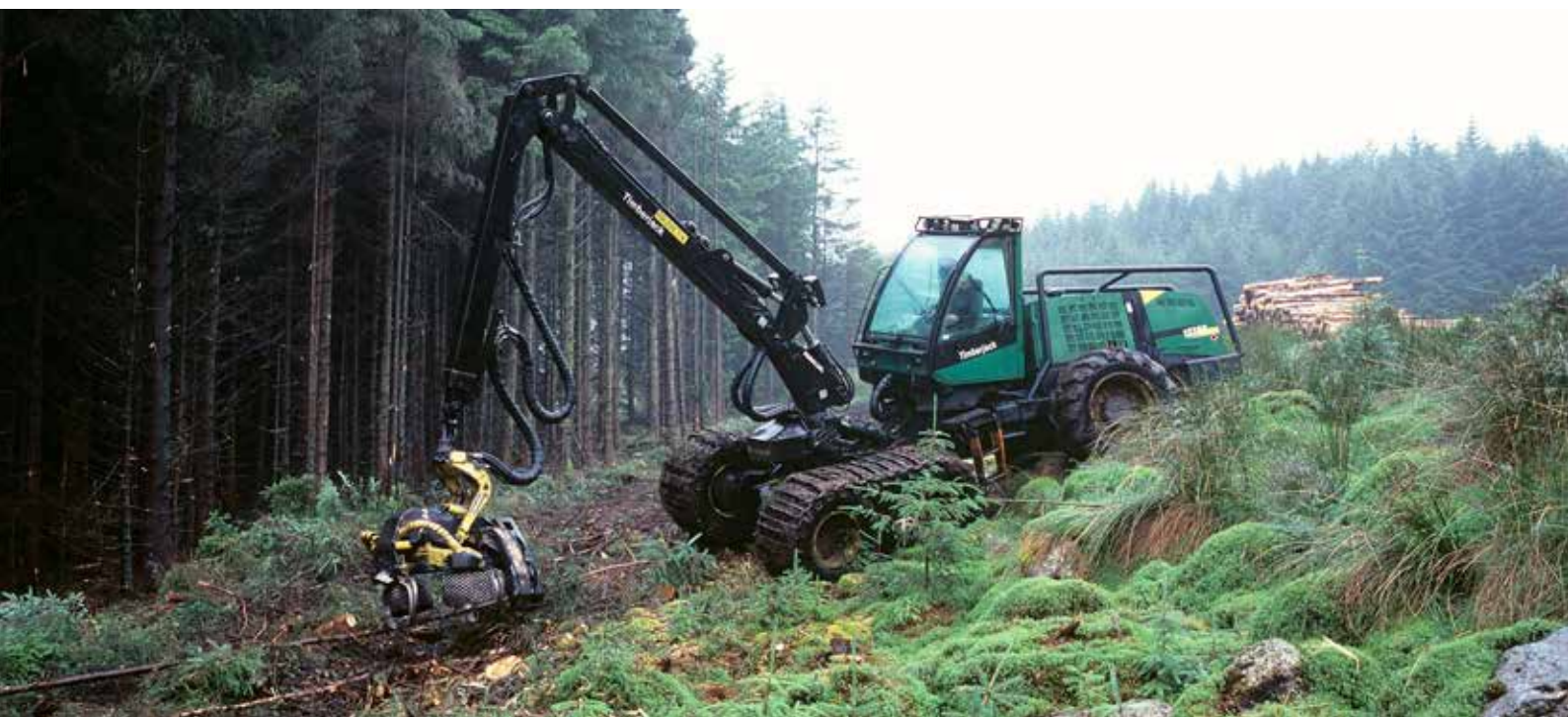
Photo 7 Clearfelling, Co. Wicklow. Circumstances exist whereby the permanent removal of trees and forests may be considered acceptable.

Note that Scenarios 1, 2, 3, 4 and 6 require the submission of a felling licence. Tree felling shall not commence until the Forest Service notifies the applicant that the permanent removal of trees is licensed.