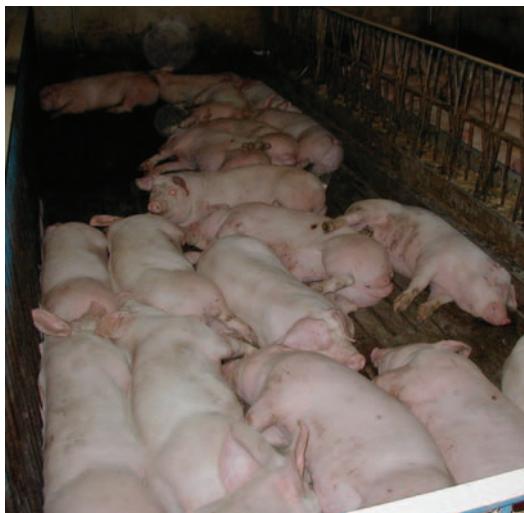
Table 6: The current minimum space requirements for growing pigs. (These figures are to be reviewed in a Commission report following research in 2008):

3.14 Stocking densities for finishing pigs Finishing pigs must not be kept in overcrowded conditions.