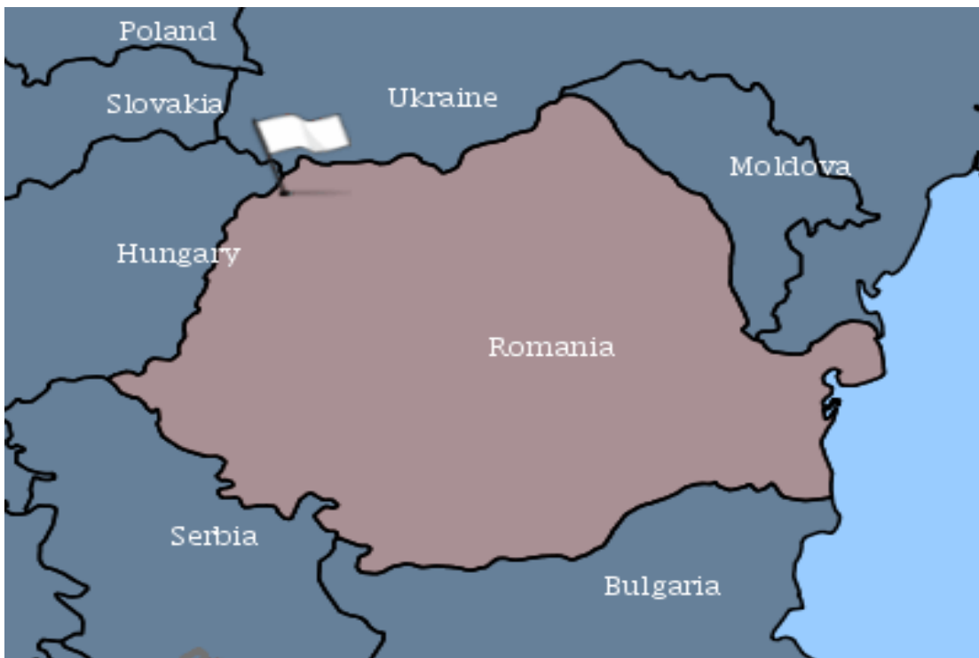
Map1: Location of first outbreak in Romania